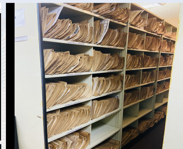
Image showing manual file registers