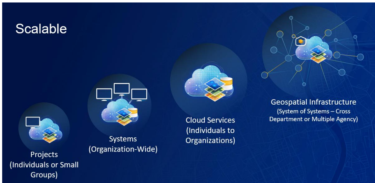
Figure 3.1.1.A. Modern GIS is scalable to meet organizational needs.