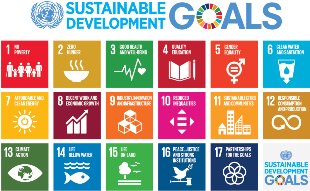
Figure 1. The 17 Sustainable Development Goals. © United Nations

Research undertaken by a range of key actors, including the World Bank, the Food and Agriculture Organization of the UN, OECD, civil society organizations, and academic institutions, shows that security of land tenure rights is closely connected with the realization of development objectives related to poverty alleviation, food security, environmental sustainability and enhancing women’s empowerment. (Mennen, 2015)