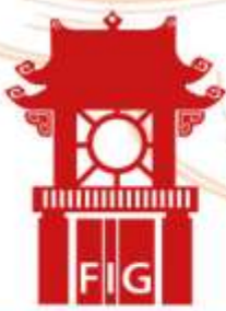
FIG WORKING WEEK 2019