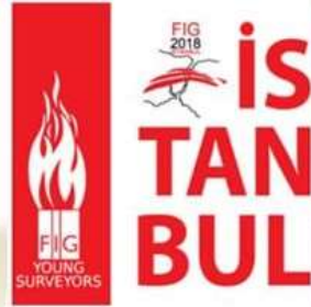
FIG Foundation Grant Recipients