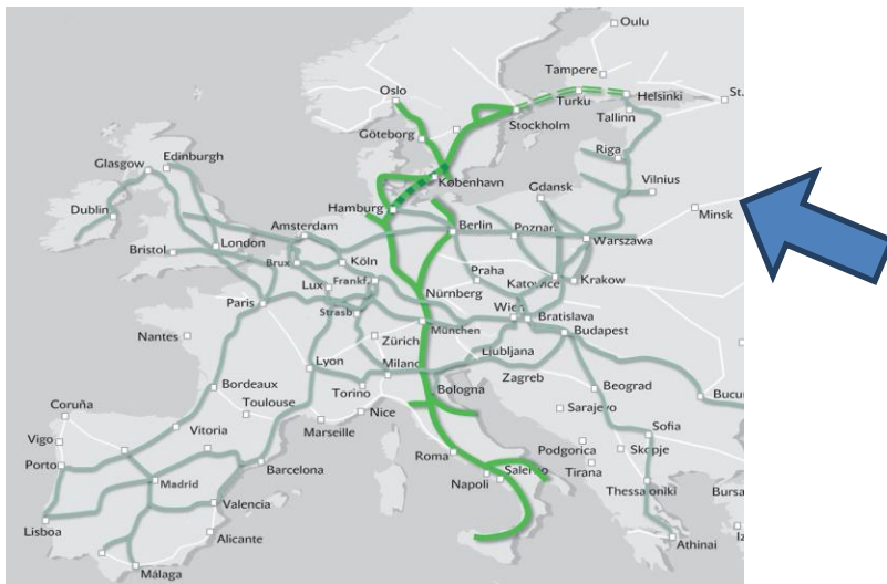
Figure 1: The corridor Scandinavia- Mediterranean along with EU's eight other Trans-European corridors. The arrow marks at the tunnel connection (source: "Green String Corridor", 2014).

By building the tunnel a transport corridor is formed that will connect Scandinavia with the rest of the Europe. It will thus improve the North- South bound connections through Europe and become a part of the Trans-European corridor Scandinavia- Mediterranean.