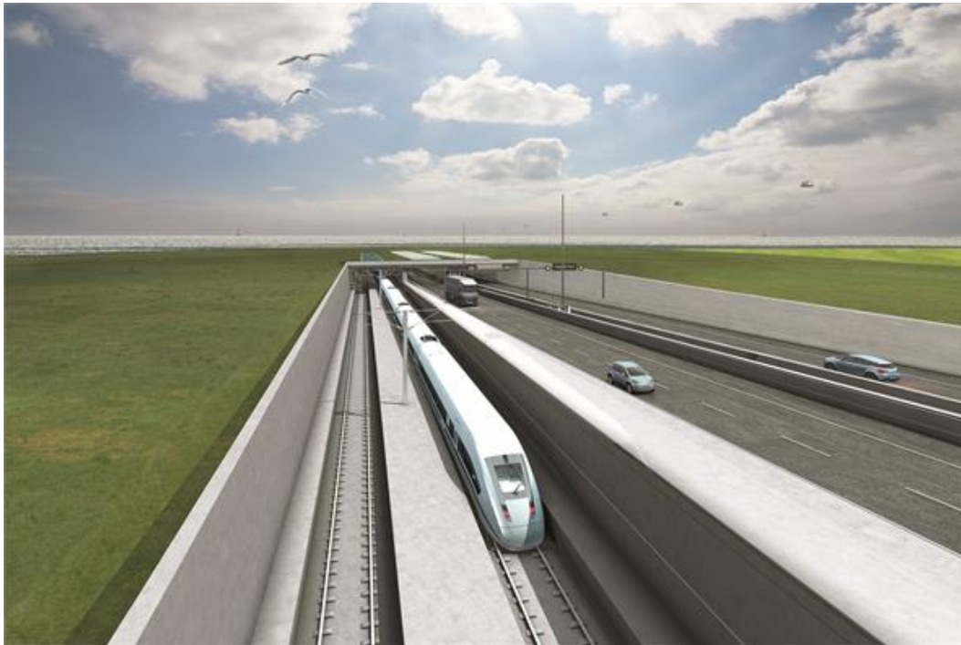
Figure 3: The future tunnel abutment on the Danish side

At 18 kilometres in length, the tunnel will be the world's longest immersed tunnel for both trains and cars. In order to establish the tunnel, a trench must first be dug into the seabed. The trench will be 60 meters wide, 16 meters deep and 18 kilometres long. The tunnel elements, pre-cast on land, will be 217 meters long and weigh 73,000 tons each. The construction budget is approximately 8,3 billion USD. The project is supported economically by EU and, in addition, by the future users through access tolls. The expected payback time is 36 years.