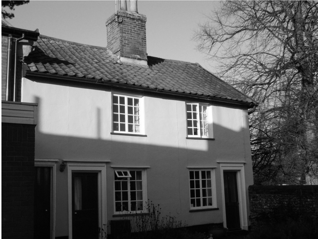
Figure 3: A row of lime-rendered traditional clay-lump cottages in the centre of Diss.