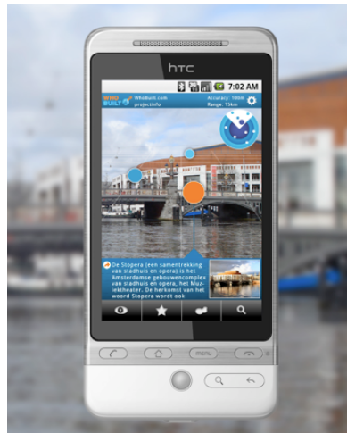
Figure 2: Example of Augmented Reality in Real Estate Marketing

transparent way, taking account of all views expressed. If the process ensures transparency and inclusivity then even difficult decisions may be easier to be accepted by all parties involved (McLaren, 2007).