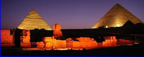
FIG Working Week 2005 Cairo, Egypt, 16 - 21 April 2005

TS 29 – Approaches in Land Consolidation and Community Regeneration