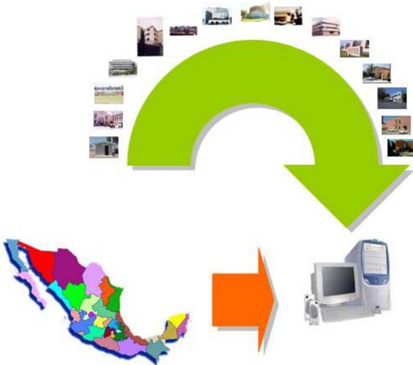
Figure 3. Scheme of deposit and consulting of RGNA's data

comments) is deposited in the central server, being located in a directory associated to the date of registry and that is available during 90 days.