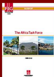
Task Force report