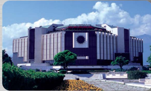
National Palace of Culture