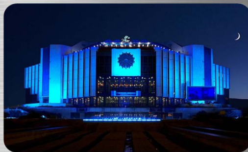
National Palace of Culture