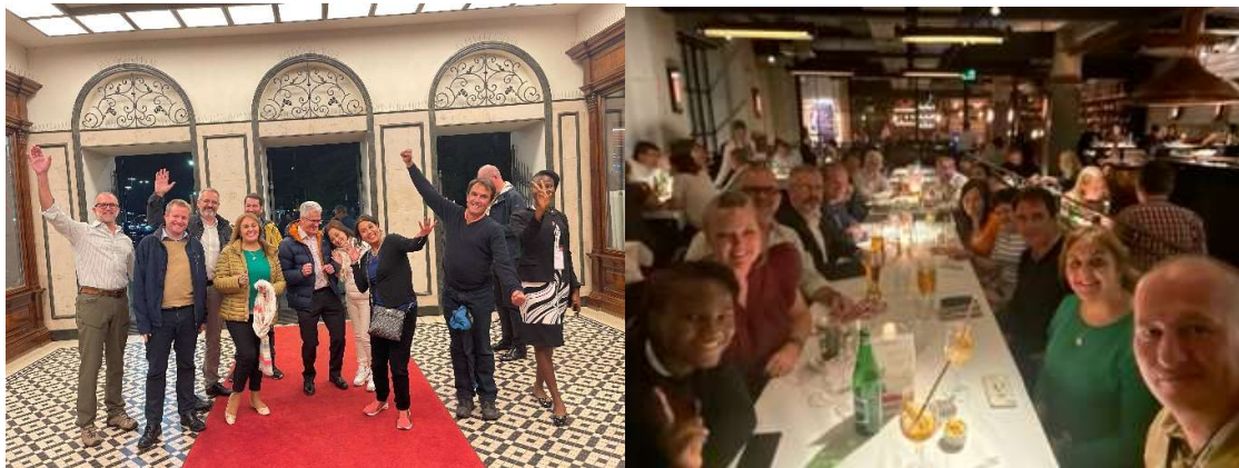
A nice time at the Commission 2 dinner.