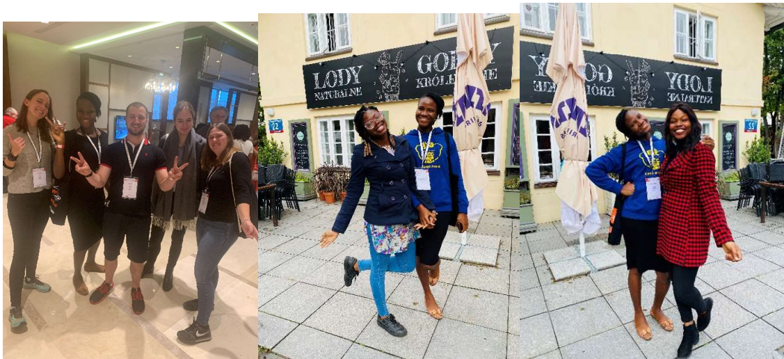
Meeting Surveyors from diverse backgrounds