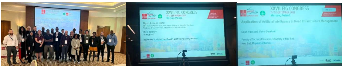
The technical sessions were inspiring, packed with valuable information. After one of the sessions, I reached out to my mentor, expressing my feelings of inadequacy upon witnessing the advanced developments in surveying from other parts of the world.