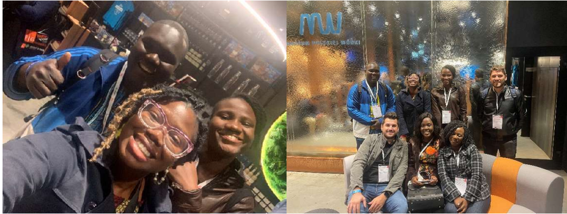
We visited the Polish Vodka Museum in Warsaw which is dedicated to the rich history and cultural significance of vodka in Poland.